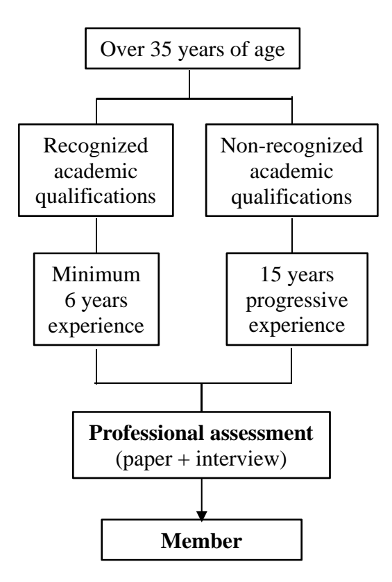
Figure 2. Mature Route