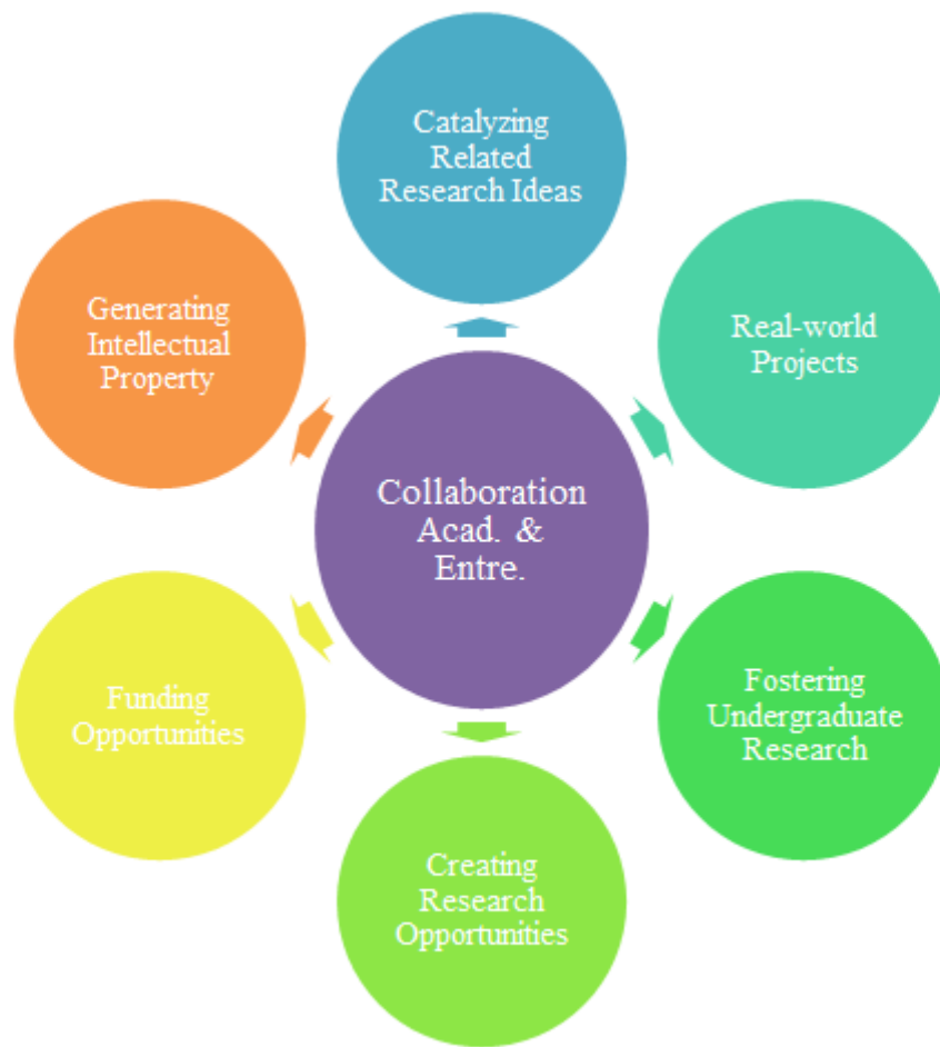
Figure 1 Resulting benefits from collaboration shown in surrounding circles

1) that support that support applied research initiatives in general and the robotic healthcare initiative in particular.