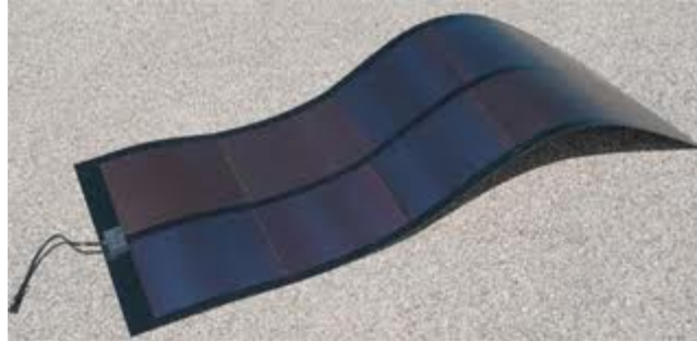
Figure 3. Flexible Photovoltaic Panel. 5

claims that they can manufacture panels in excess of a mile (1.6 km) long. This claim is quite credible considering the nature of the web manufacturing process that they employ to build it. Other units are available, for example, a 68 Watt panel for $189 and a 128 Watt flexible peel and stick unit for $230 at amazon.com. 2