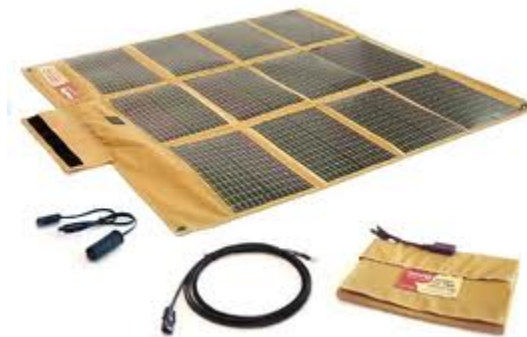
Figure 4. Folding Solar Panel. 6

The fourth unit is a folding solar panel. These are quite popular with the military because they fit flat inside the cargo pocket of a field uniform. An example with desert colors is shown in Figure 4. In the experiment at hand, a 10 Watt folding panel retails for $174. It has dimensions of 8.9 x 26.7 x 3.3 cm folded. It fits into a backpack and is designed to charge phones or small laptop computers. These panels are popular for charging marine batteries. Other typical units are a smaller AA battery charging unit for $49.85 and a 26 Watt foldable array for $387 on amazon.com. 2