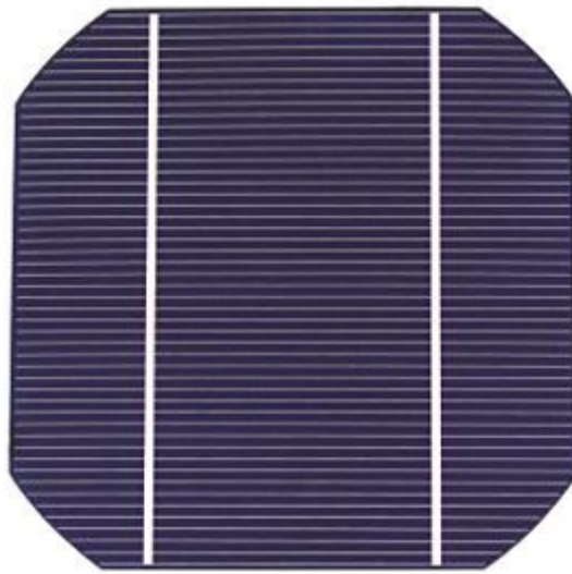
Figure 1. Typical Monocrystalline Cell. 3

technology was already on hand as a demonstrator unit in the department. For those who lack such a heritage, a 5 Watt unit from Instapark® is $36.75 with a controller. Other monocrystalline units are, for example, $109.70 for a 30 Watt unit with a controller, and $240 for 100 Watt unit with a controller. All are available in single-unit quantities on amazon.com. 2